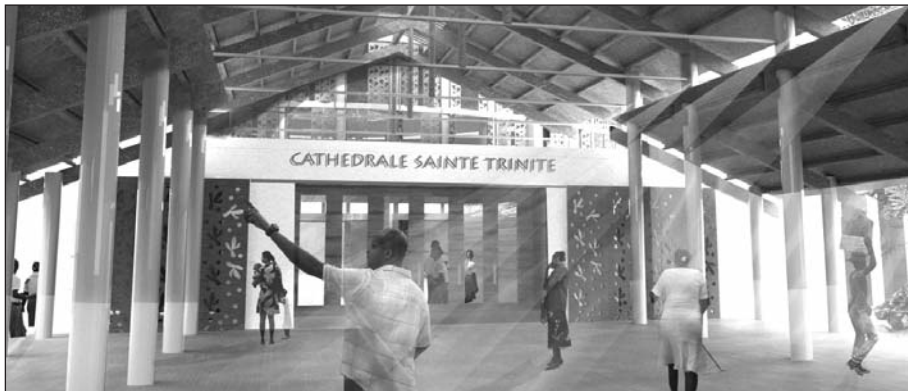
Illustration of the newly designed Holy Trinity Cathedral, Port-au-Prince

As Haiti prepares to mark the fourth anniversary of the devastating earthquake in 2010, Episcopal Church Presiding Bishop Katharine Jefferts Schori has asked the Episcopal Church to remember the Diocese of Haiti on the fourth anniversary of the earthquake on January 12. I urge all Episcopalians to pray and give in solidarity with our largest and fastest-growing diocese," the Presiding Bishop said. "I ask for your generosity to aid the Diocese of Haiti in rebuilding Holy Trinity Cathedral in Port-au-Prince."